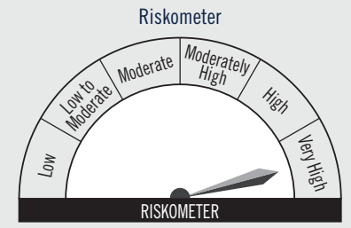
Investors understand that their principal will be at very high risk

Investors will bear the recurring expenses of the scheme, in addition to the expenses of the underlying scheme.